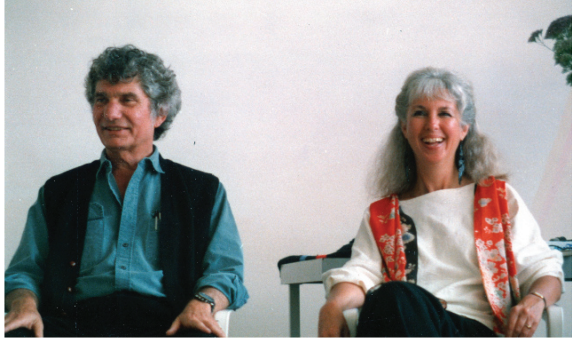
Teaching in Holland 1987

Our excitement at this time was enormous. What was emerging was something quite new. It was something that worked for us in everyday