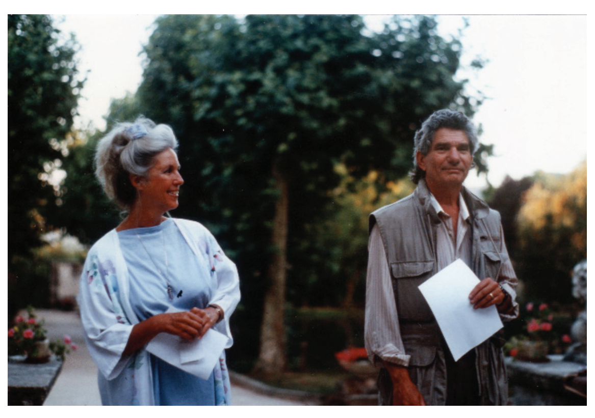
Teaching in France 1989

dream process. For still others it may manifest in meditation or spiritual practice. For many scientists it manifests in the organizing principle at work in the material world and—on a grand scale—in the galaxies. Whatever the case, the Aware Ego must be surrendered to the reality of this higher intelligence and how it can be perceived operating in his or her personal universe.