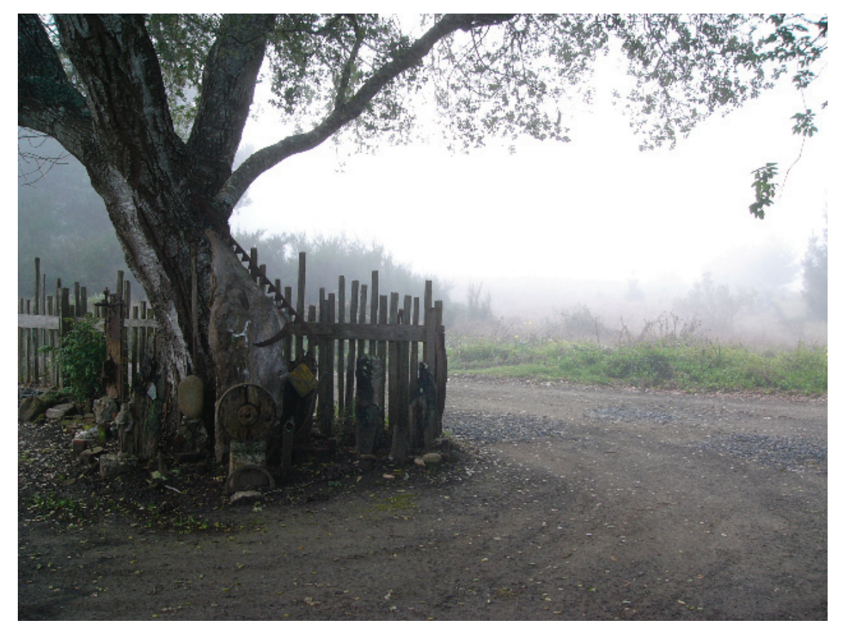
Morning Mists at Our Home in Albion

All of this is an ongoing process that can last forever. One of the greatest surprises and delights of our aging process is the amount of change, creativity, and intimacy that remains for